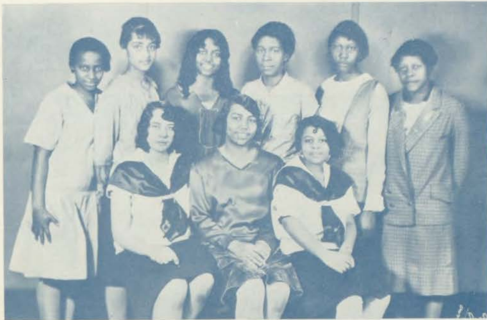
SENIOR MEMBERS OF THE HONOR SOCIETY