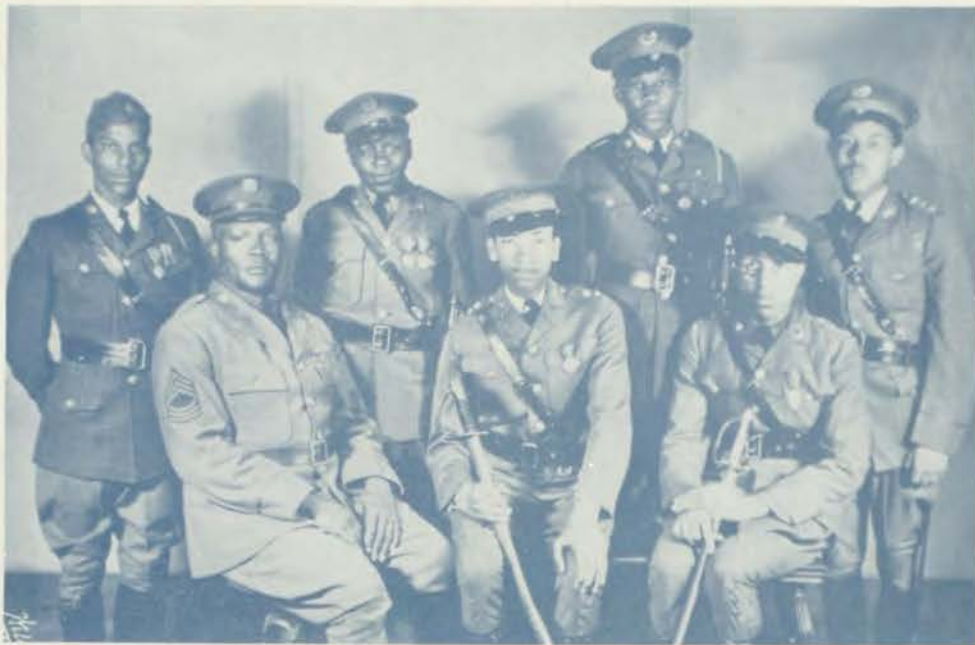
R. O. T. C. STAFF OFFICERS

One of the most outstanding divisions of every busy high school is the progress it makes in the R. O. T. C.