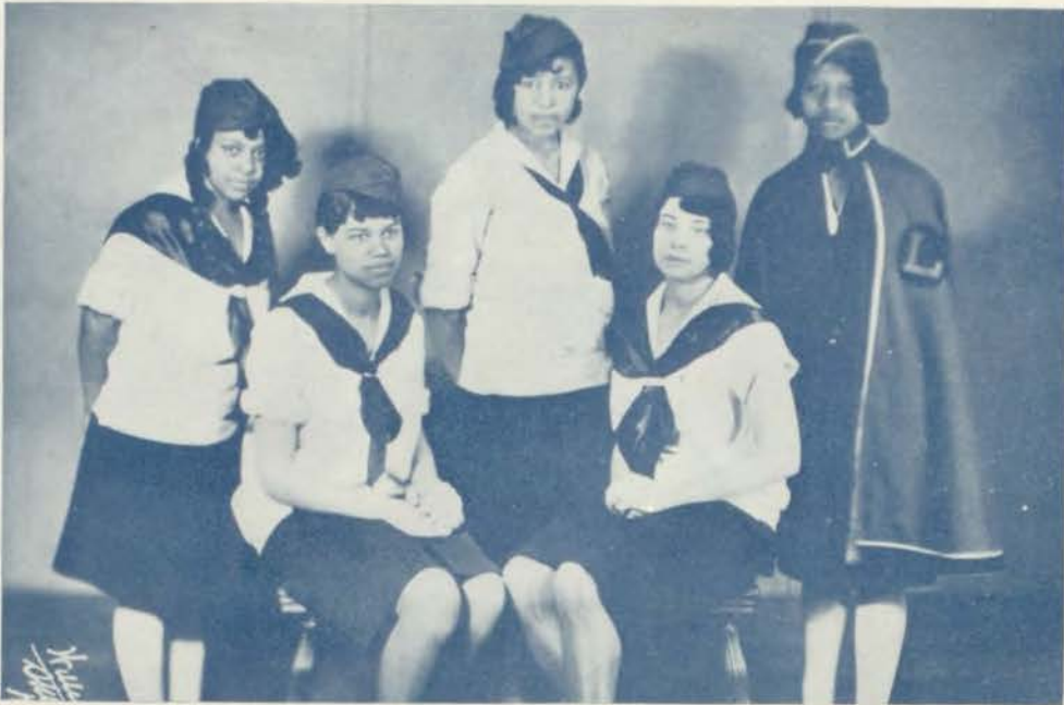
SPONSOR MAJOR AND HONORARY CAPTAINS