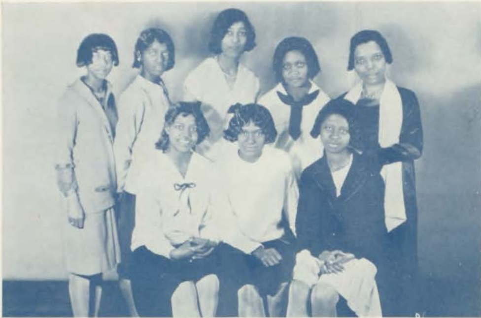
SENIOR GIRLS GLEE CLUB